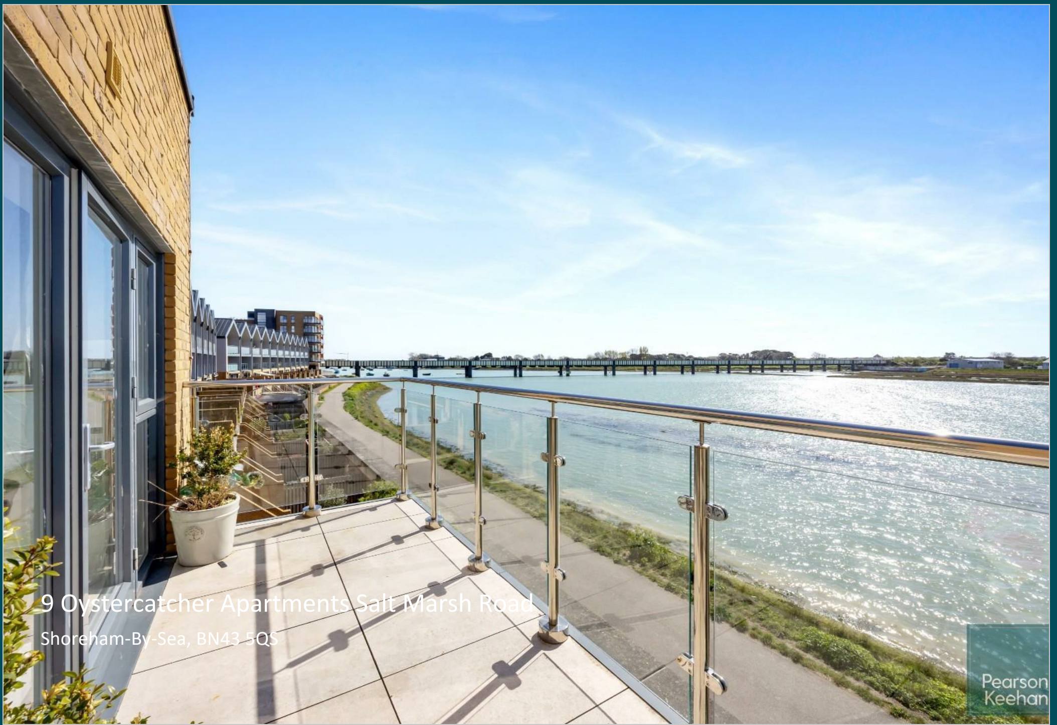
9 Oystercatcher Apartments Salt Marsh Road Shoreham-By-Sea, BN43 5QS